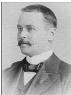
Portrait 1. Ronald Ross