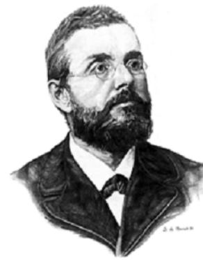
Portrait 2. Battista Grassi (1854-1925)